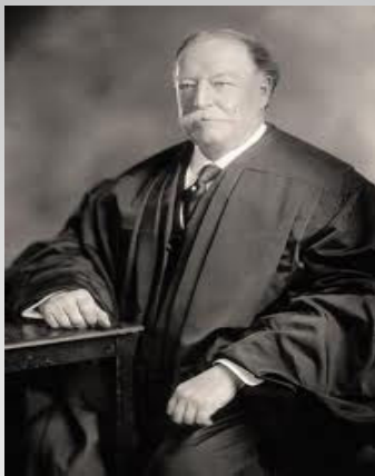
Chief Justice William Howard Taft