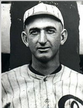
Shoeless Joe Jackson