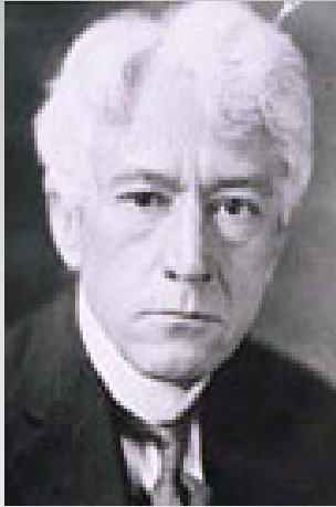
Kennesaw Mountain Landis